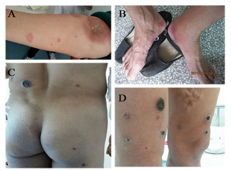
Figure 1: Clinical features in a patient with MF. (A) Infiltrated plaques on the right arms. (B) red patches on the feet. (C–D) ulcerations and dark crusts on the back and legs.

Combined of the tests and modified ISCL/EORTC revisions of MF, the case can be diagnosed with MF