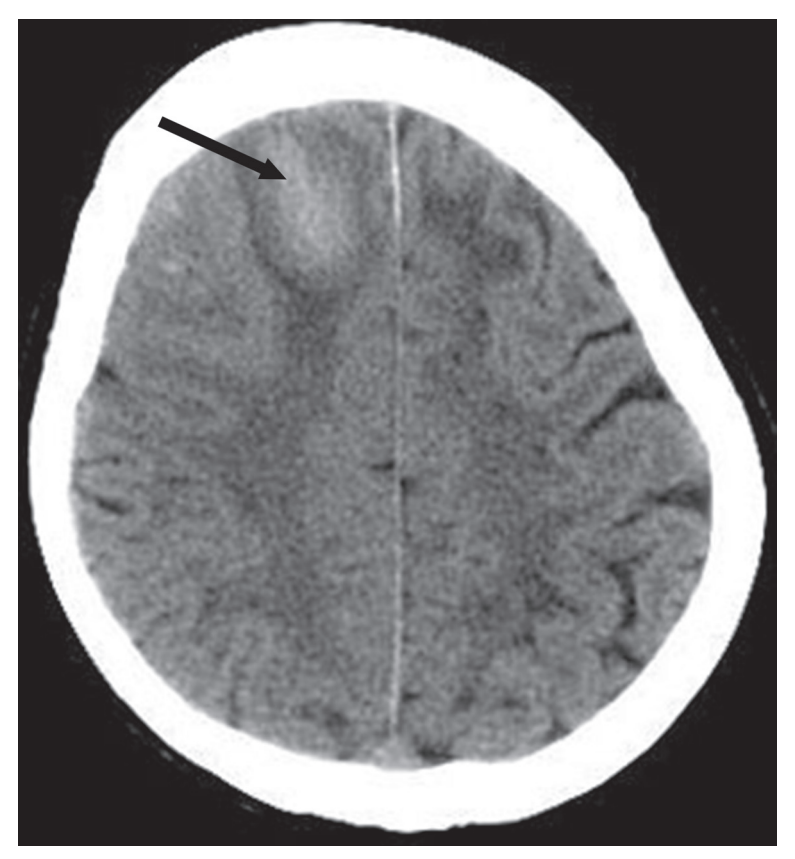
Figure 1: Noncontrast brain computed tomography shows a hematoma (arrow) in the right frontal lobe.

elevation of inflammatory biomarkers, meningeal irritation was positive, and MRI supported a suspected CNS infection, CNS infection was proposed as the most likely diagnosis in this previously healthy adult. After CSF was sent for culture, we selected ceftriaxone to implement our choice of anti-infective therapy. Isoniazid, pyrazinamide and rifampin were used as an anti-tuberculosis treatment and mannitol was used to reduce intracranial pressure. An acid-fast bacillus in CSF was not found and the CSF culture was assessed as negative. Unfortunately, 2 days after admission, the patient suddenly lost consciousness and showed corectasis. The patient accepted emergency craniotomy and 4 days after admission, the patient died.