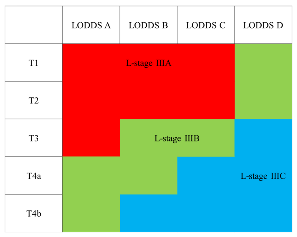
Figure 2: Classification of L-stage subgroups based on 5-year cancer specific survival (CSS). (A) 5-year CSS in pathologic T and LODDS category. (B) L-stage IIIA: 5-year CSS \geq 90% (red), L-stage IIIB: 5-year CSS \geq 70% to < 90% (green), and L-stage IIIC: 5-year CSS < 70% (blue).