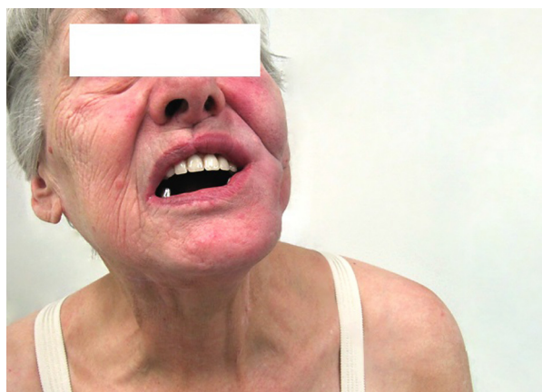
Figure 4: Complete regression of the primary tumor (38 weeks from ipilimumab initiation).