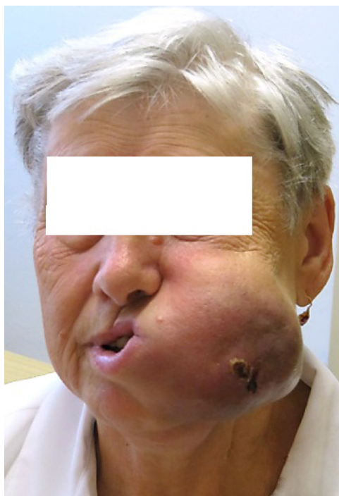
Figure 2: Rapid tumor progression during ipilimumab therapy.