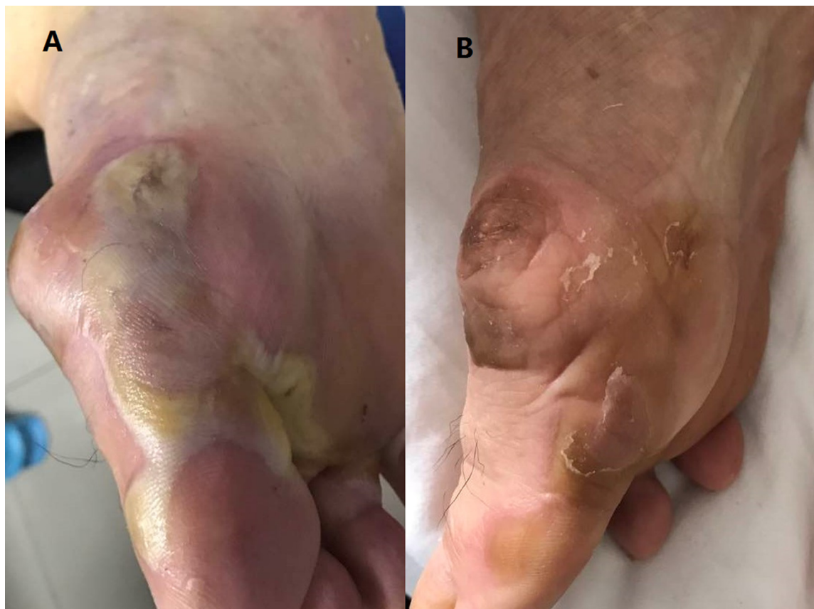
Figure 2: The grade 4 hand-foot syndrome. (A) Taking apatinib for 6 weeks. (B) A week off the drug.

high dose. [6], These data demonstrate that apatinib has a significant effect and can be well tolerated as a salvage therapy. Given few trial focused on patients with lymphoma, we managed a study to reveal the efficacy and safety of apatinib in lymphoma patients. Considering that