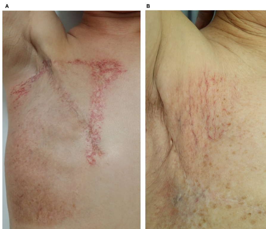
Figure 2: (A) A typical case with right breast cancer who developed skin telangiectasia at the following 3 sub-sites after PMRT with conventional technique. The overlapping region between medial tangent and IMN fields, SCV/chest wall fields' junctions and elsewhere of chest wall; (B) a typical case with right breast cancer whose skin telangiectasia occurred elsewhere of chest wall following IMRT-based PMRT.

This study has some limitations which need to be addressed. First, it's necessary to be conscious of the inherent pitfalls of a prospective but non-randomized study, particularly of the potential extent of observer