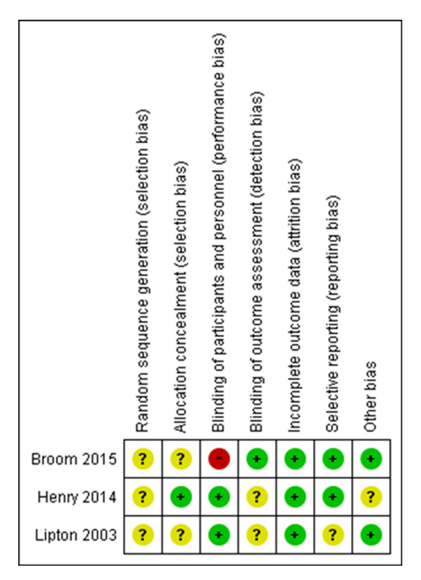
Figure 2: Risk of bias table with the three studies included in the systematic review.

Zoledronic acid significantly delayed the time to first SRE compared to controls. The median time to first SRE for zoledronic acid and placebo arms was "not reached" and 2.4 months (P = 0.006), respectively, whereas that for zoledronic acid plus everolimus and everolimus alone