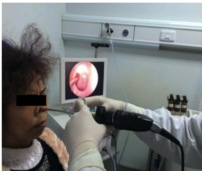
Figure 3: CNB was conducted under the guidance of nasal endoscope.

The patients were in a seated position (Figure 3). The nasal cavity of each patient was anesthetized with a spray mix of 1% ephedrine and tetracaine. High performance endoscopic system (VISERA Pro OTV-S7Pro, Olympus Medical Systems, Tokyo, Japan) equipped with the WL mode and NBI mode was introduced in the examination of nasopharynx. Disposable 18-ga semiautomatic needles (18 G × 130 mm, Stericut with a co-axial guide; TSK Laboratory, Tochigi, Japan) were used. Puncture was conducted under the guidance of nasal endoscope, and the core needle arrived at the nasopharynx through nasal meatus. The specimen notch of the inner stylet was set within the target. The puncture was performed as