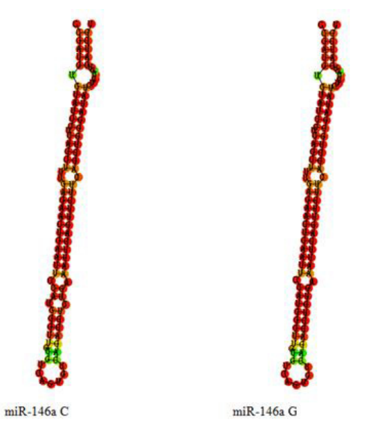
Figure 2: Sequence variations in the miR-146a can translate into structural alterations. The RNA secondary structure was predicted by RNAHYbrid. Only the most stable secondary structures with the lowest free energy are depicted.