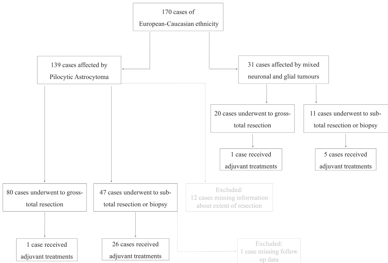
Figure 2: The flow chart of patient selection, including histological and extension of surgical resection criteria. The excluded cases by the analysis are reported in grey colour.

Finally, a Poisson regression model was performed in order to evaluate the role of clinic-pathological and genetic variables in influencing hazard ratios (HR). Statistically significant variables in the bivariate analysis or clinically important variables were subsequently included in the multivariate analysis. The following variables were considered into the saturated model: gender (female vs. male), age at diagnosis ( \leq 24 months vs. > 24 months), site of lesion (supratentorial vs. infratentorial), additional treatments (yes vs. no) and p53 codon 72 SNP (Arg/Arg vs. Arg/Pro or Pro/Pro).