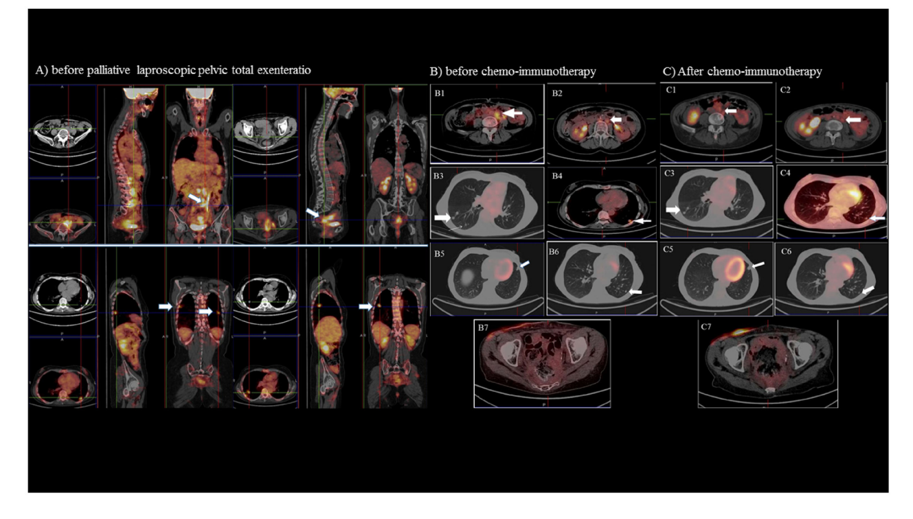
Figure 2: Positron emission tomography (PET) and computed tomography (CT) imaging. The imaging of the disease extent before laparoscopic total pelvic exenteratio (Panel A) show in particular in the upper scans a large area of intense hypercaptation of the metabolic tracer in the pelvis and in the lombo-aortic and common iliac lymph node (white arrows); in the lower scans multiple positive areas in the lung (apical segment of the right superior lobe, superior segment of the inferior lobe bilaterally, a medium postero-basal segment of the left inferior lobe (white arrows). (Panel B and C) shows the PET/CT and CT imaging before (panel B) and after (panel C) chemo-immunotherapy of the: 1-2) left lombo-aortic lymphnodes; 3) right lung nodules; 4-6) left lung nodules; 7) pelvic region.

Five days after surgery, the patient was discharged with improved general conditions (PS 2; pain VAS 6). Fifteen days after surgery, based on the results of PDL1 assessment and NGS that suggested a potential response to immunotherapy, we started a combination regimen with the anti-PD1 antibody nivolumab 3 mg/kg every two weeks in combination with metronomic chemotherapy (cyclophosphamide 50 mg/day continuously). One month after treatment start the patient achieved a significant